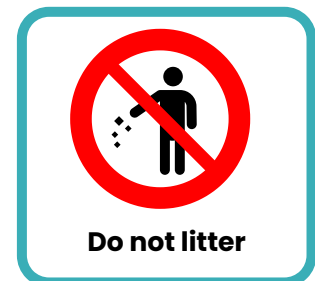
Do not litter