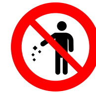
Do not litter